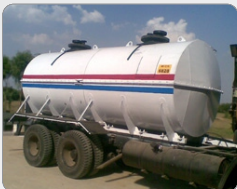
TRANSPORTATION HDPE TANKER