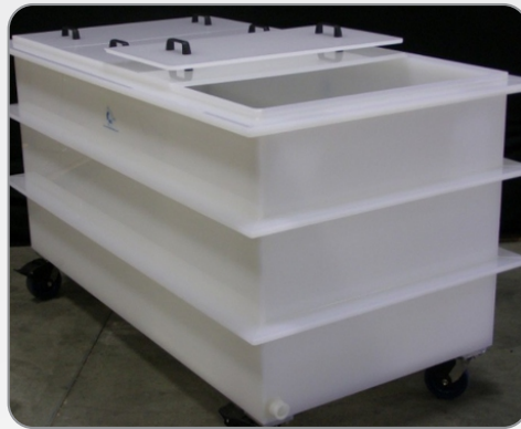
PP CHEMICAL STORAGE TANK