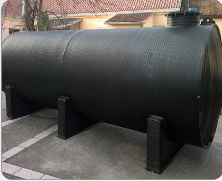
HORIZONTAL HDPE TANK