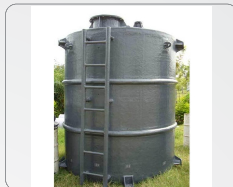
FRP VESSEL ON MS TANK

2) We develop an international variety of " SPIRAL " STORAGE TANKS FOR CHEMICALS STORAGE - Spiral Tanks Are Innovative Thermoplastic Storage Vessels Manufactured By Fabricating Spiral Pipe And Have Been Serving The Needs For Industrial Sector In Chemical Storage Since The Past 10 Years