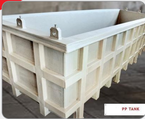
ELECTROPLATING PP TANK