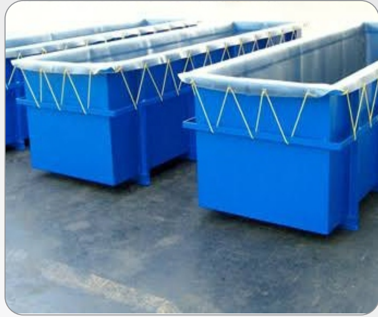
FRP AICD TANK