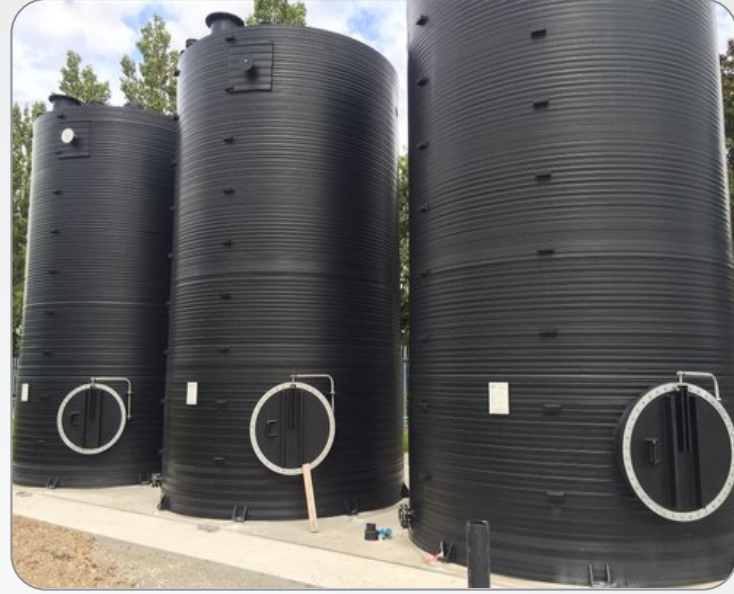
HDPE & PP SPIRAL TANK